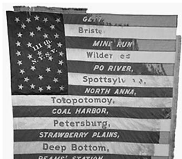
National Color of the 111th Regiment NY Infantry NYS Military Museum and Veterans Research Center

This is an excerpt from the Times of Wayne County article written by George McGraw, published July 7, 2024. Used with permission.